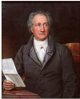
Johann Wolfgang von Goethe